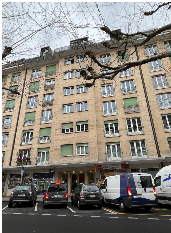
Rue Dancet 8

Ideally located in the Plainpalais district of Geneva, around 200 m from the University of Geneva (Uni-Mail) and 400 m from the Geneva University Hospitals (HUG), this building was acquired by the SICAV at the end of 2020. Public transport links are excellent, with the «Uni-Mail» tramway stop 150 m away and the Champel LémanExpress station 800 m away. The 8-storey building comprises 27 apartments ranging from 2-room to 4.5-room and 3 arcades. The building currently has an average IDC (over the last three years) of 490 MJ/m 2 , and is heated by an oil-fired boiler. In line with its renovation strategy, the asset manager has obtained planning permission in early 2024 to carry out a complete renovation of the building at a cost of CHF 1.1 million. The work will include replacing the boiler with two heat pumps, replacing the windows, insulating the facade and installing solar panels. This renovation will enable the building to obtain Minergie certification and the HPE label. At 30.09.2023, the building had a market value of CHF 16.96 million, a cost price of CHF 16.27 million and a rental income of CHF 0.57 million. The building's rental reserve is estimated at around 25%.