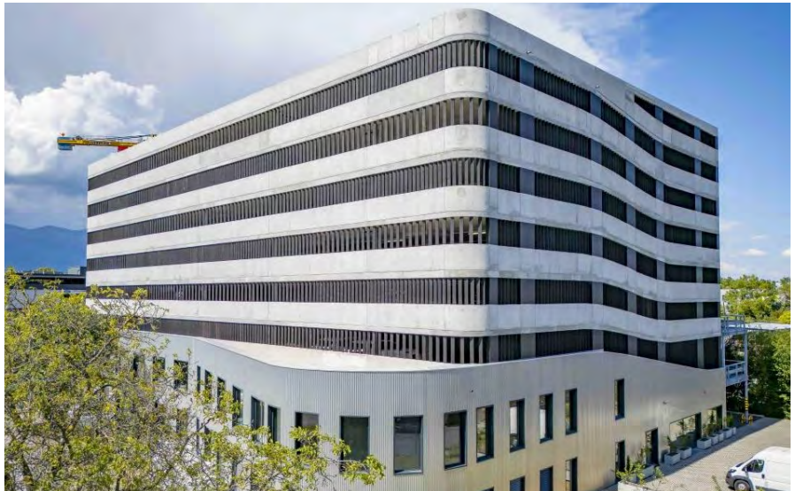
Rue des Ateliers 4 in Meyrin (GE)

Acquired for CHF 24 million, the property delivers a gross yield of around 4.9% and fits within a core strategy providing secure long-term income.